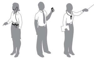
3 WAYS TO USE THE MICROPHONE